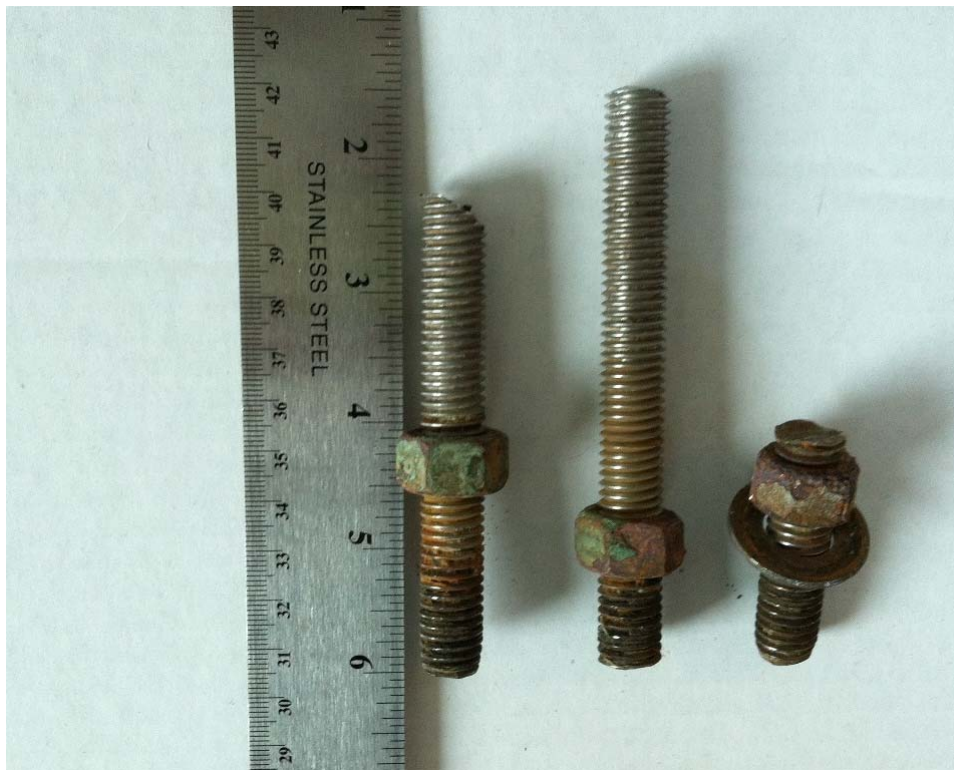
Bolts from the original construction recovered by divers from the fish screen guides – March 2012.