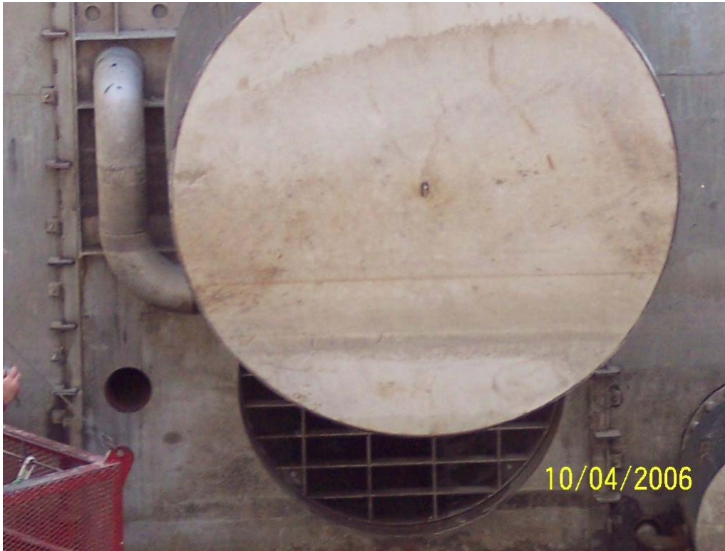
Elkhead liftable fish screen and guides on tower face – now 80 feet deep in the reservoir